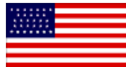
31-Star Flag — see article on Page 3