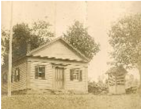
The Pound Ridge Public School.